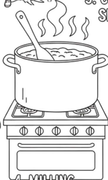
4. MILLING & PURÉEING